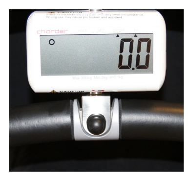
Easy to use and read. Big display.