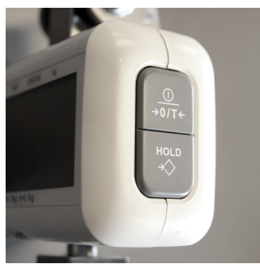
On/Off/Zero/Tare and Hold buttons

System mounted on the Luna ceiling hoist.