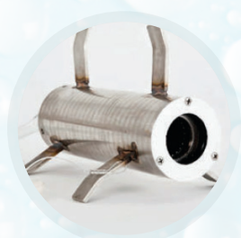
Rotation base to be cast in concrete

Two solutions for mounting the Pool E-185: